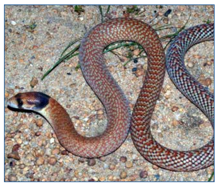
Hooded scaly-foot legless lizard.