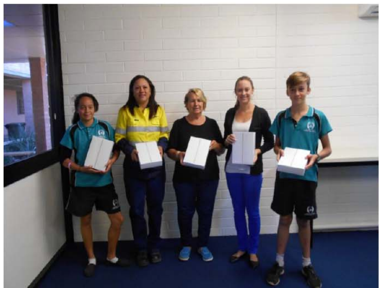
KWDHS Councilors receiving iPads, Donated by Goldfields St Ives