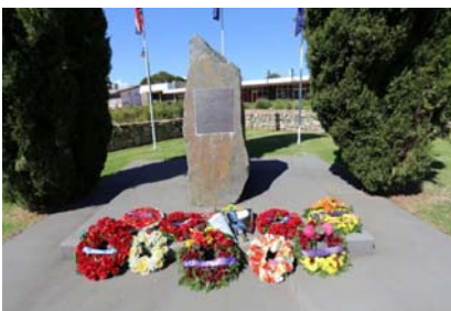
Reaths laid at Dawn and Parade Services