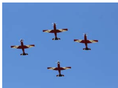
Planes flying over Parade Service