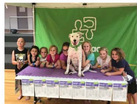
Jimmy, Head Space therapy dog