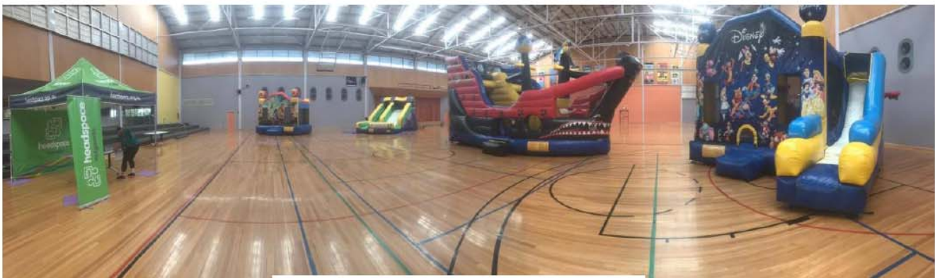
Fun Day Set up

All the kids that participated in the holiday program were all so well mannered and a pleasure to have over the two weeks!