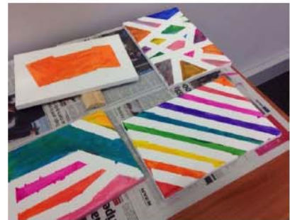
Library arts and crafts

For the second week of the April holidays the kids put their creative skills to use and created works of art using paint, a canvas and a bit of tape; they were also challenged with using their patience to create the first letter of their name out of cardboard and wool. Further on in the week the kids had a go at playing Pingo, with each participant winning a prize in the end. Progressing on to the end of the week the kids were treated with a cooking class, making scrumptious cookies and delicious pizza. For the final holiday program activity a Youth fun day was held where Jump 4 Us Kalgoorlie came out, turning the Kambalda basketball stadium into a jumping wonderland. Head Space also came out with their therapy dog Jimmy who was very popular with the children. The kids were treated with yummy hotdogs for lunch and sweets of fairy floss and pop corn to keep them going for the day.