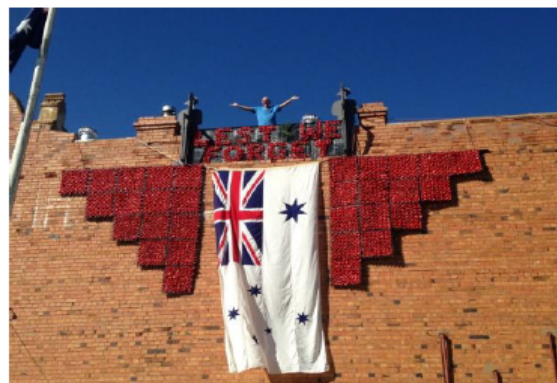
Alan Bergin happy with the final result

If you would like further information on upcoming activities, please contact Leanne on 9025 0301 or email: Coolcrc@coolgardie.wa.gov.au