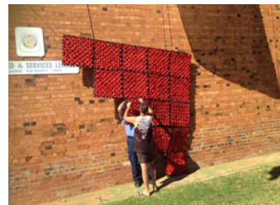
Coolgardie community members assembling the poppy display on the Coolgardie RSL Memorial Wall