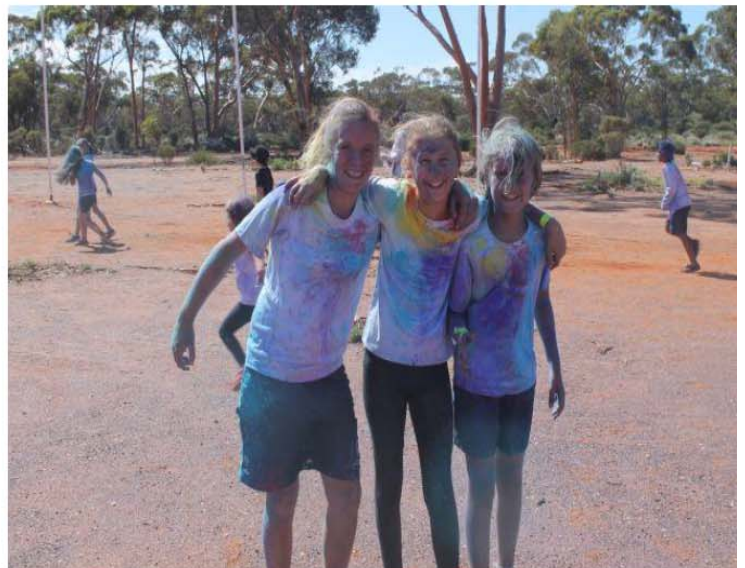
KWDHS Students enjoying the colour fun run