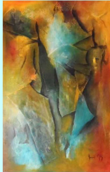
Examples of what will be taught

Our program is supported by our regional partners, the Shire of Coolgardie.