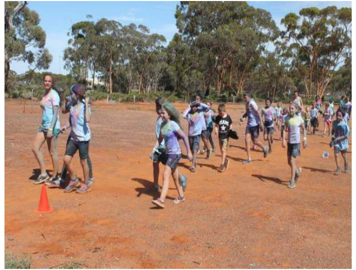
KWDHS Students enjoying the colour fun run