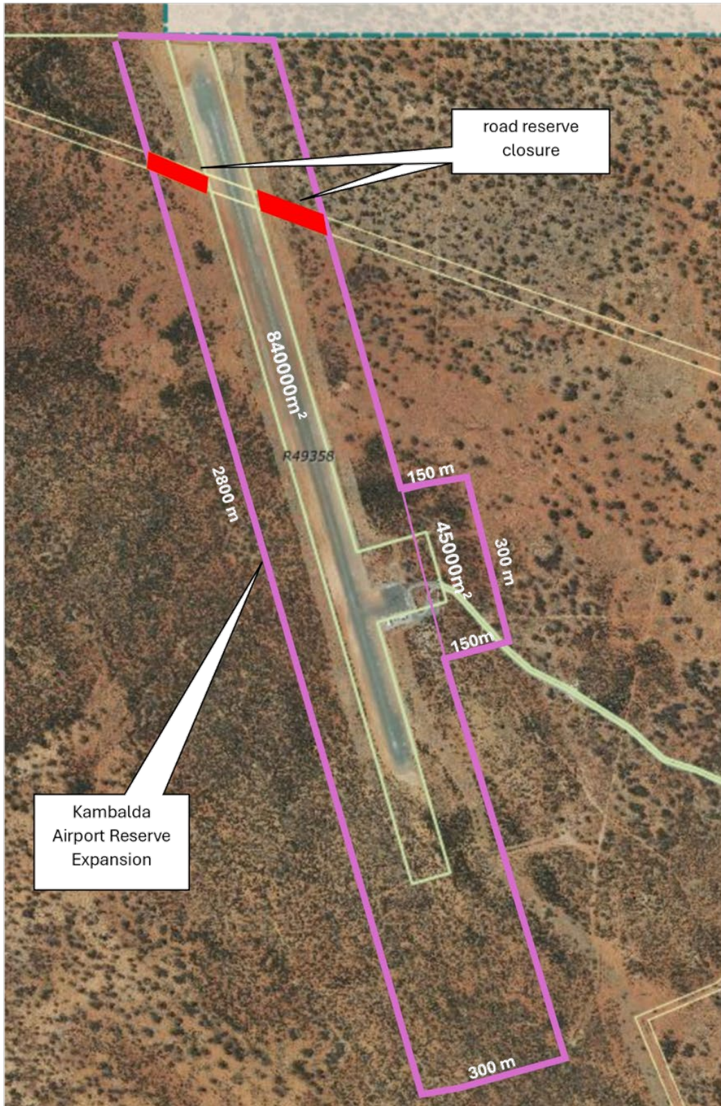
Kambalda Airport Expansion - Area and dimension